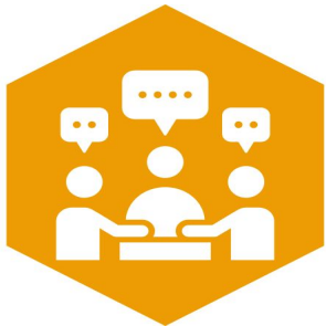
Peer Assisted Learning